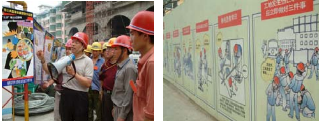
Safe production propaganda in the construction site