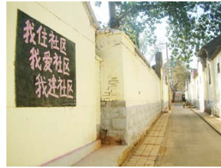
After renovation (as well as wall painting)