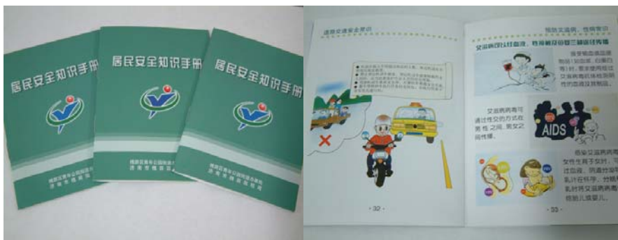
Safety Knowledge Handbook

Before the summer vacation, a series of safety education activities have been carried out in the primary and middle schools in the community to reduce accident and injury that used to occur in summer vacation. The station made 60 safety education pictures covering public safety, fire safety, traffic safety and so on. The exhibition was held in three schools alternatively and each student was distributed a Safety Knowledge Handbook which tells them about safety knowledge to which they should pay attention to in daily life.