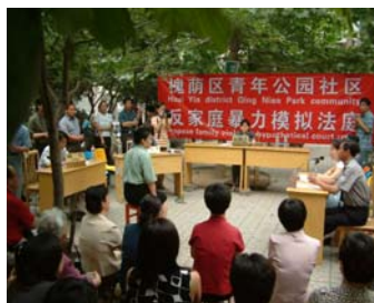
Moot Court against Domestic Violence

--Improvement of popularization and safety awareness: About 6,000 "Handbook on Domestic Violence" brochures and over ten thousand of written proposals titled with "Refusing Family Violence, Creating Happy Life" were distributed to the families in Youth Park Community to call on residents to be against family violence. Also experts and lawyers were invited to carry out "Moot Court against Domestic Violence" activity in the "Propaganda Week" and "Propaganda Month" of the community. The activities make residents understand legal knowledge and relative stipulations in a straight way through the case demonstration and analysis.