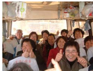
Deaf-mutes in the “Community Love Delivery Bus” after supermarket shopping

Due to the obstacles in walking or communication, disabled people normally have trouble in shopping outside, which increases the risk of accident and injury for them. In order to solve this problem, the Youth Park Sub-district Office has started to provide a shopping bus named “Community Love Delivery Bus” to pick up the disabled at their doors once a week since March 25, 2005. Besides the shopping bus to the supermarket, “Shopping Service Volunteers” were also arranged on the bus to help the disabled people.