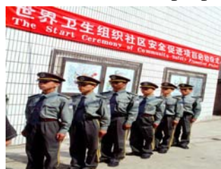
The Safety Patrol

In addition, in Jinan city or even in China, the “110” mechanism for police service has already been established for a long time. Every time when resident are at risk or suffer criminal offences, as long as he or she dial the number “110”, the police will arrive in no time and deal with the issue properly.