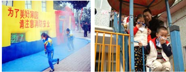
Fire escape drill held in primary school and kindergarten

to deal with a fire. Fire prevention personnel are invited periodically to explicate fire emergency knowledge in various ways: posters, demonstrations in public places, and fire escape drill. Besides training residents directly, we also popularize fire safety to the Neighborhood Committee and local enterprises so as to publicize fire safety through these institutions.