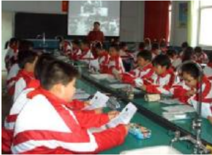
The theme meeting of "Safety" exercises