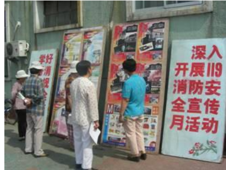
The propaganda activity on fire safety knowledge.