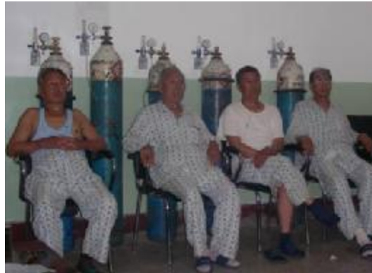
The pneumoconiosis patients are getting the recovered treatment .

The Effect of Implementing the Safety Promotion Program at Work-places