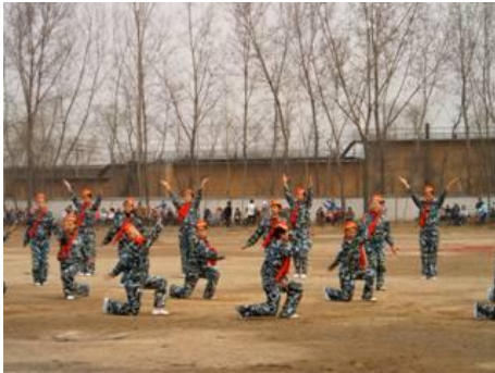
The Primary School Games in Spring