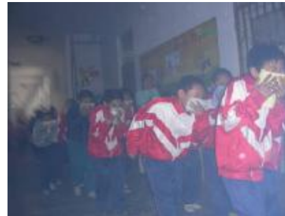
Primary school students were escaping from fire.

5.7.7 On 17 th May, 2006, fire safety group and Qianjiaying Primary School organized jointly the students to attend the fire fighting exercise of escaping from fire and showed them how to use fire-fighting appliances. The firemen of Kailuan Qianjiaying Fire-fighting Team told the teachers & students how to avoid sudden fire & how to use correctly fire hydrants and took a fire-fighting exercise.