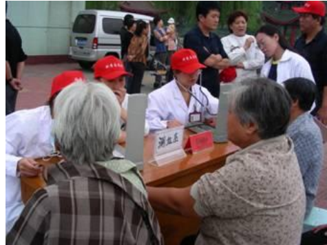
The medical volunteers are making free diagnosis for the old people.

5.6.4 Inviting the medical experts to give lectures on health for old people.