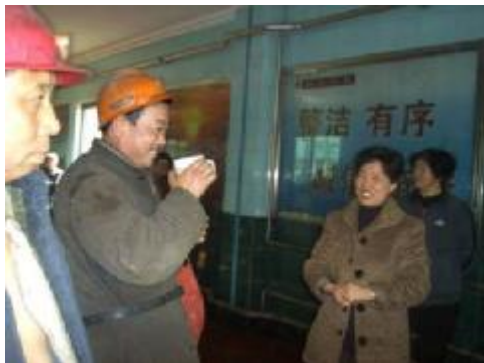
The miners’ families members are exhorting miners to pay more attention to their safety during work