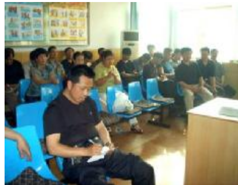
Education Meeting on work safety before work.

▲ The implemental program on the topic of “Cultivating Safety Culture and Nurturing the Inherently Safer Staff-workers; ” were conducted from July , 2006 to July , 2008. On 13 th July, 2006, the conference on “Cultivating Safety Culture and Nurturing the Inherently Safer Staff-workers” was held in the community. The leaders and staff-workers’ representatives from the relative production units in the