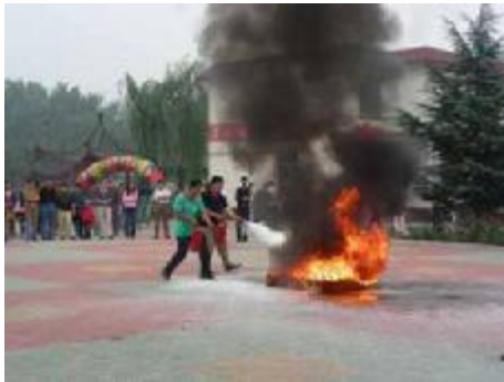
Fire control exercise