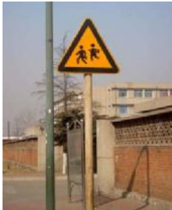
The Safety Sign at Work-sites

▲ Setting up the united safety signs at main places , important work-sites and key posts .