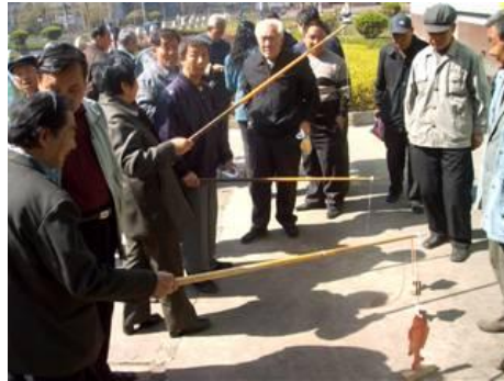
The Old People Games in Spring

Since implementing the program, just one injury accident has happened.