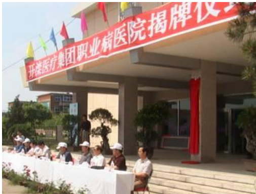
The Unveiling Ceremony of Kailuan Medical Group Occupational Diseases Hospital