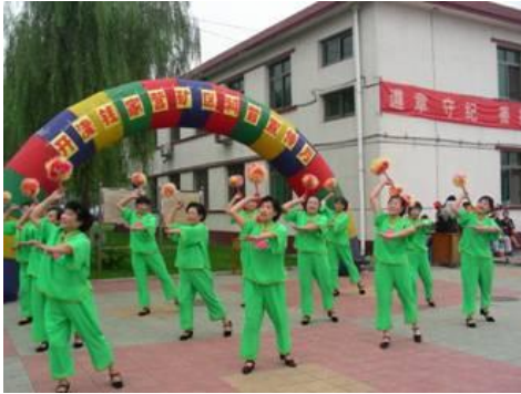
The dance team of old people is showing.

5.6.3 Holding the recreational and sport teams for old people, Such as ping-pong team, stickball team, dance team, traditional opera team and Taiji boxing team.