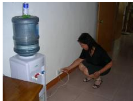
Identifying the Dangerous Sources in the Residential Houses