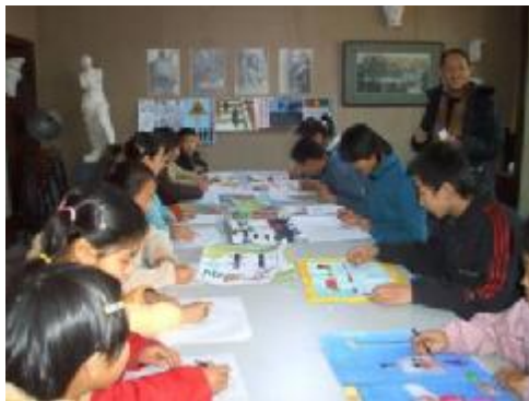
The students are taking the caricature contest on the traffic safety.

The safety education group holds the activity of “Traffic Safety Week” in the schools each term on the topic of enhancing traffic safety awareness reducing traffic injuries. The traffic safety awareness of the students has been improved through knowledge lectures on traffic safety given by the traffic policemen, soliciting articles competitions on traffic safety, the shows of caricature on traffic safety, the theme meeting on traffic safety of the students and knowledge contests on traffic safety.