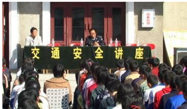
Knowledge lecture on traffic safety is being given .