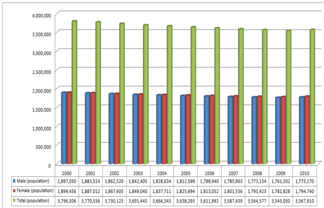
Figure 1. Population trends by sex in Busan Metropolitan City (Statistics Korea)