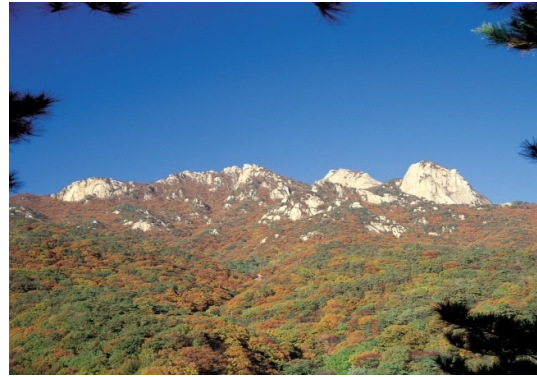
<Bukhan Mountain National Park >

Gangbuk-gu is located in the north-western tip of Seoul and over half of the district is composed of parks and greenery, thus giving it cleaner atmospheric conditions than other parts of the City. Bukhan Mountain, a guardian mountain of Seoul, stretches over Ganbuk-gu, making our district the number one destination for mountain climbers around the city and Korea.