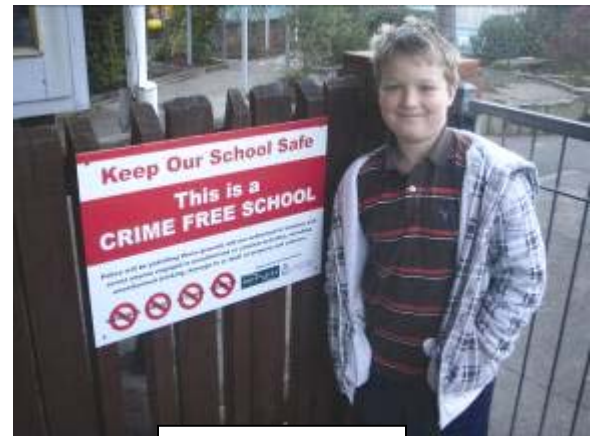
Crime Free Schools