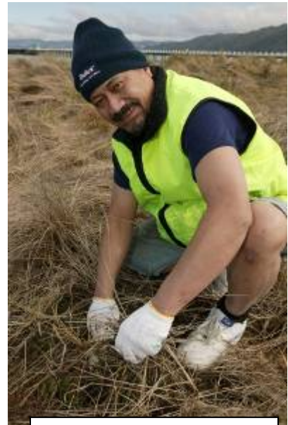
Dulux Workplace Health and Safety