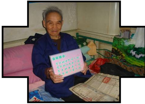
A sign with a gentle reminder