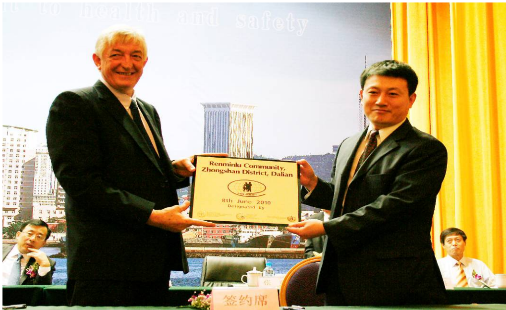
Meetings held about the Safe Community: