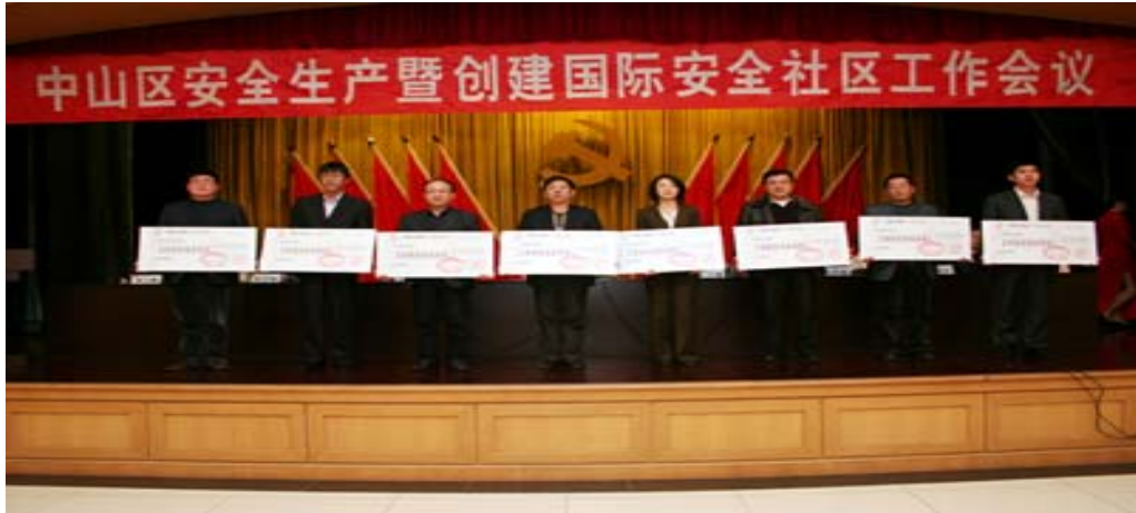
Associating parties organized about Safe Community: