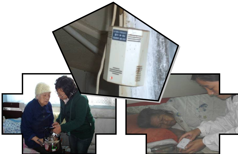
A whistling kettle