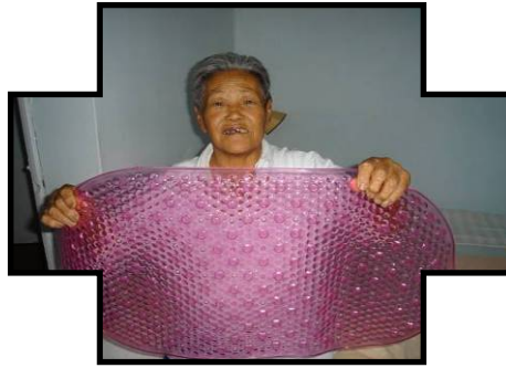
A nonslip mat