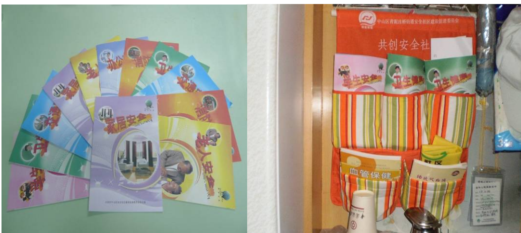
A Guide to Family Safety