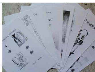
“Innermost Thoughts and Feelings” tabloid

◆Hold the parents’ forum and the parents’ psychological knowledge speeches. On the parents’ day, the inspections are organized, and the home-school contact cards are distributed in order to make parents understand the psychological problems of their kids and participate in the intervention activities.