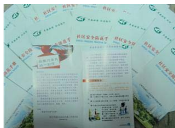
safe community brochures