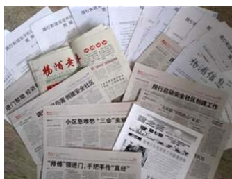
briefing of safe community building work