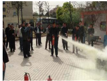
Training for how to use fire extinguisher

◆Establish a firefighting volunteer team of 302 persons to patrol the residential quarters where the firefighting safety hazards may easily occur.