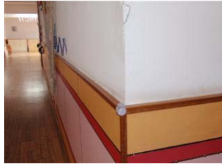
Safety protection/prevention bar

Anti-clamping device on the door and safety prevention/protection bars are installed at all kindergartens.