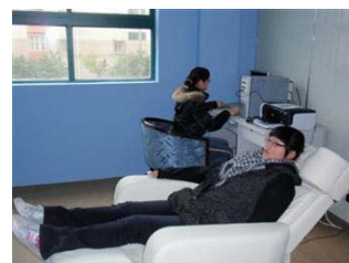
psychological evaluation room