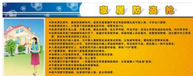
safety publicizing bulletin boards

◆According to the principle of round angles, the facilities in the park, such as lawn guardrails, road corners and publicizing board shall be of round angles.