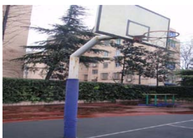
Injury prevention of school's sport activity facilities

Safety precaution facilities and warning signs are set up at the sport activity place and passages with dense flow of students.