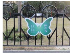
injury prevention reminding boards