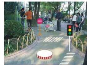
the simulated traffic intersection