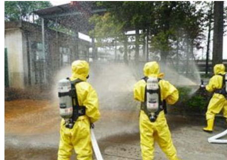
liquid ammonia leakage drill