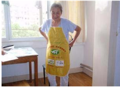
Safe community publicizing apron