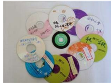
Legal and firefighting education CD for students in the community