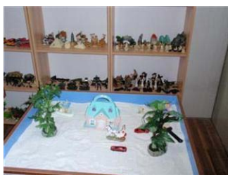
psychological consulting room