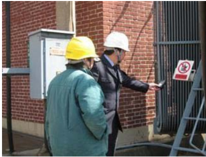
The monitoring staff are conducting ionizing radiation test

examination for the workers in occupational hazard workplace.