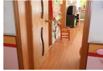
Anti-clamping device of door