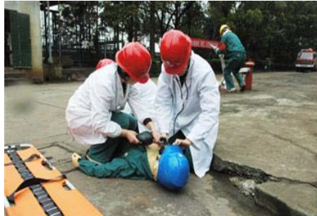
Poisoning rescue drill