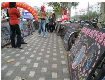
Residential committees carried out firefighting safety blackboard evaluation

◆The residence firefighting safety publicizing activities are carried out in each neighborhood block throughout the community at the 3rd weekend of each month.