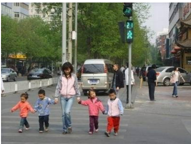
Teaching children how to cross the road