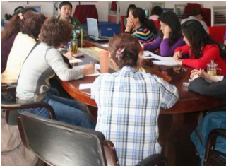
Training of the children's parents

✓ The parents were regularly gathered to discuss and determine the possible dangers injuring children and the solution to them. Schools gave lectures on children's safety to parents to enhance their safety awareness and ability to prevent injury of children.