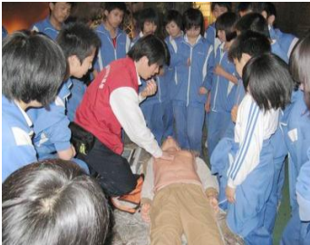
Volunteers was teaching ways of self-protection and avoiding danger.