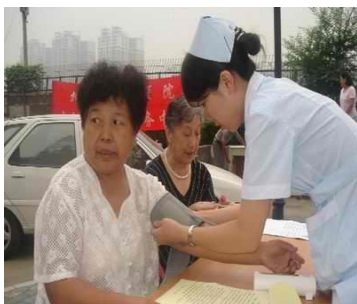
Physical check-ups for the elderly

Thanks to the safety intervention, the injury rate of the elderly in Datun Community (Street) has witness a gradual decrease during 2006-2009. Take the injury of falling-over of the elderly as an example, the data of injury surveillance shows that it fell from 290 ( 2.9% of the total aged) in 2006 to 108 (1.1% of the total aged), down by 1.8 percent points.