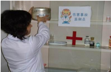
Injury surveillance spot in the kindergarten.

✓ Invite the policemen, fire fighters and doctors to give live introduction, drill and guide to the children so that their abilities of self-protection and avoiding injury.