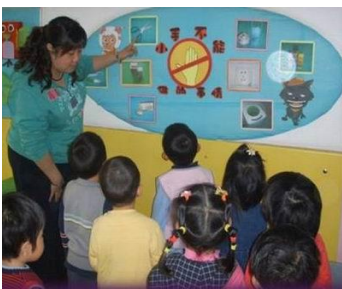
Teaching self-protecting skills