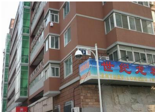
Surveillance cameras in the community

Viewing from the annual cases from 2006 to 2009, the overall is decreasing. In 2008, the cases decreased greatly in comparison with 2007, but in 2009 the total of cases bounced and increased by 24.6% in comparison with 2008, decreasing, however, by 14.6% in comparison with 2007. The community still needs to integrate social resources and adopt corresponding measures to carry out comprehensive prevention of public security cases.