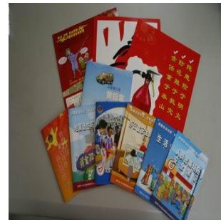
Safe community publicity materials