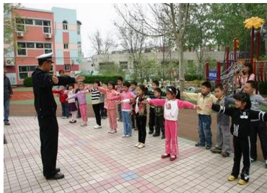
Traffic education and legal education in kindergartens