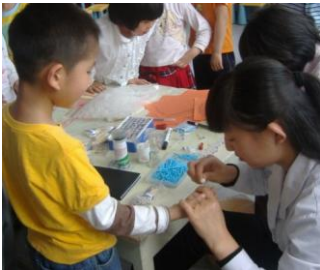
Doctors was performing disinfection for the bruised child

✓ Invite the policemen, fire fighters and doctors to give live introduction, drill and guide to the children so that their abilities of self-protection and avoiding injury.