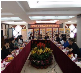
Head of schools and kindergartens shared experience of safety management.

✓ Carry out safety check of schools regularly to urge the improvement of the safety facilities and ensure the implementation of the safety management.