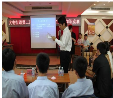
Knowledge contest on safety and health