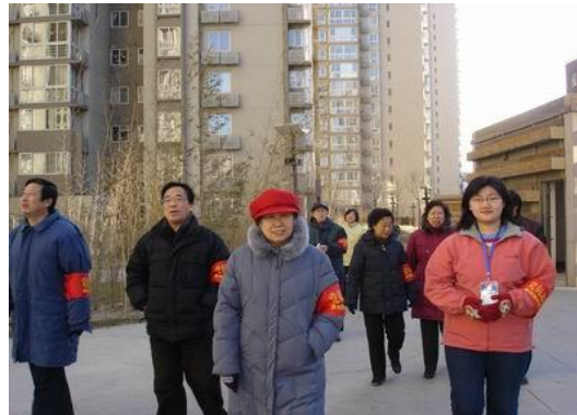
Patrolling and security guard by volunteers