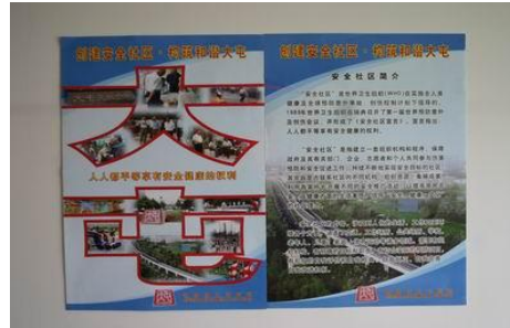
Safe community publicity and poster

Since 2006, safe community promotion committee, in order to cooperate with publicity and education, have made more than 20 kinds of safety manuals, publicity books, safety knowledge discs, safety knowledge papers, publicity posters, etc. and given out (pasted) 200,000 pieces.