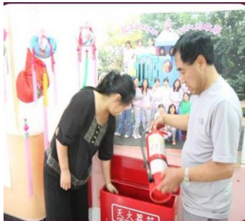
Check the fire control facilities in kindergartens