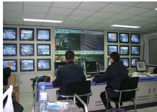
surveillance room at the management and command center