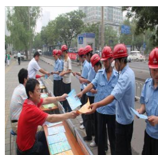
Special safety and health propaganda activities