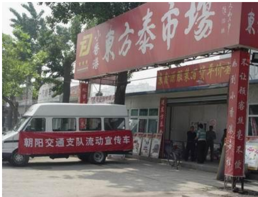
Publicity of traffic education

Statistics show that thanks to the intervention program, traffic accidents in Datun community in 2009 witnessed a decrease by 34% with 15 injuries fewer than those in 2007.