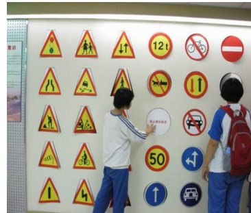
Visit safety education base

✓ Schools held regular evacuation drill of fire and explosion.