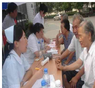
Visiting Service for the elderly