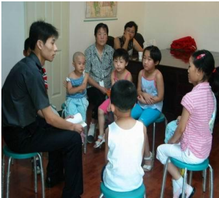
A policeman was teaching children ways of self protection

✓ Make use of the social resources and organize various social activities increase children's security awareness and self-protection ability.