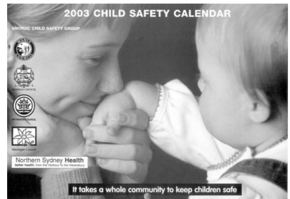
Child Safety Calendar