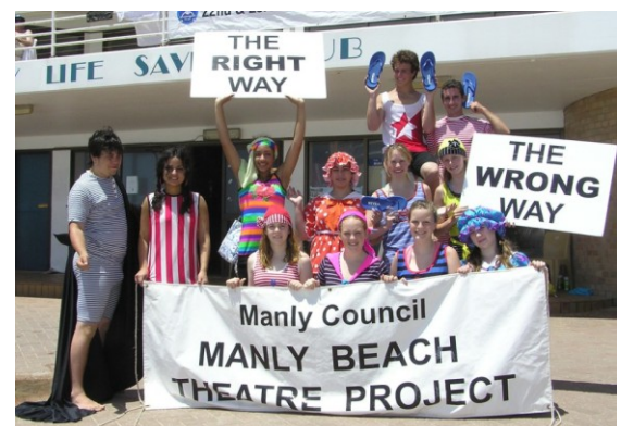
Manly Beach Theatre project