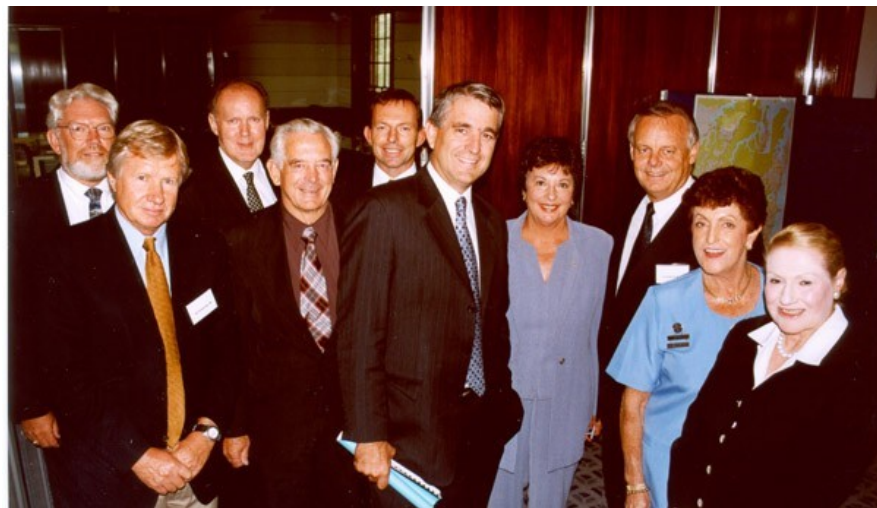
Photo from first designation ceremony in 1999

- Conference presentations at: 4 th World Conference on Injury Prevention and Control, Amsterdam 1998 (2 posters), 2 nd National Conference on Injury Prevention and Control, Melbourne 1998 (1 plenary, 2 papers), the 8 th National Health Promotion Conference, Sydney 1996 (1 paper, 1 poster), SHOROC was showcased at the 1 st Asia-Pacific Injury Prevention Conference, Presentation at the 6 th National Conference on Injury Prevention and Control in Perth in March 2003, involvement in the 2 nd NSW Safe Community Symposium, representation at the 8 th , NSW Sports Safety Awards attendance in November 2002.