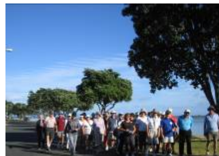
'City on its Feet' programme