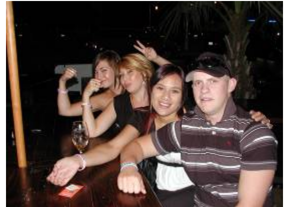
MOD squad – moderating our drinking campaign