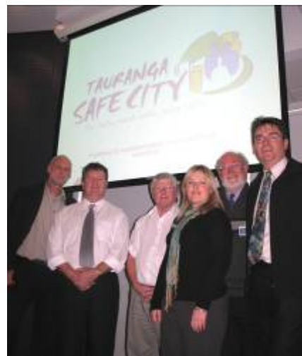
Tauranga Safe City Steering Committee