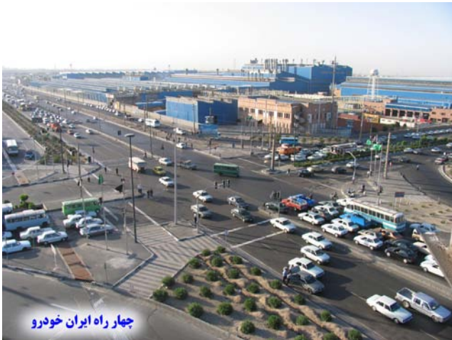
Industrial centers in district 21