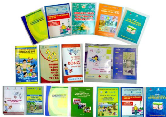
Books of health information and education on accident prevention