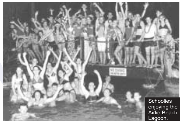
Schoolies enjoying the Airlie Beach Lagoon.

2001 was the biggest Schoolies Week ever in the Whitsundays with around 1,500 young people celebrating. There were no arrests and no major incidents all week.