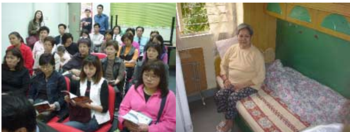
L: Firefighters instructing eagerly listening citizens in a housing estate in Tuen Mun. R: Retired people are also focus for safety promotion in the Tuen Mun community.