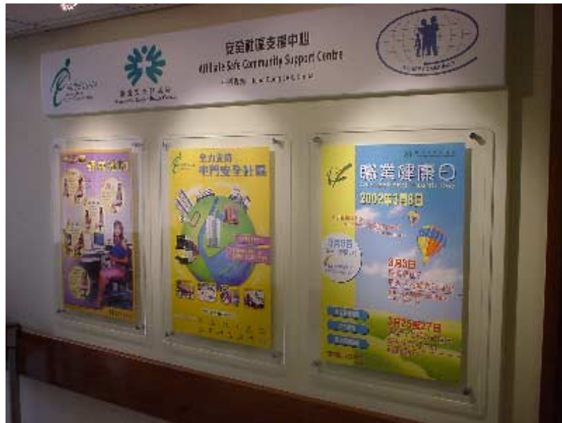
Safety education material provided by OSHC in Hong Kong – affiliate Safe Community Support Centre.