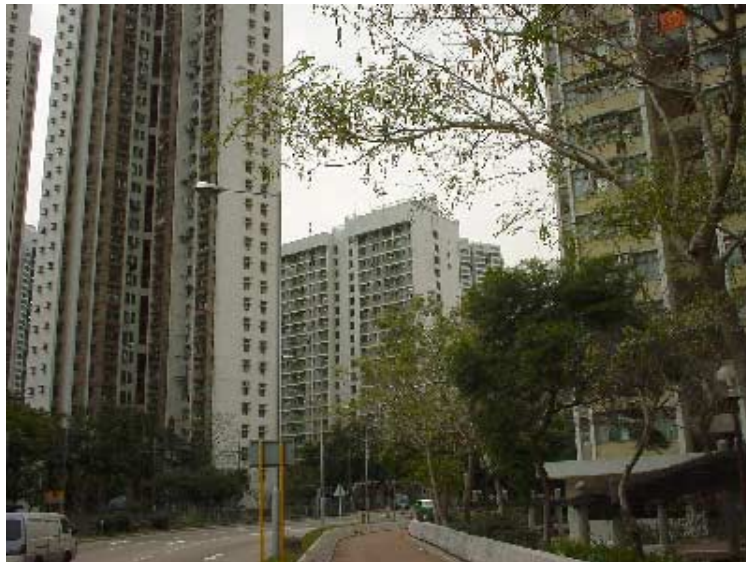
Typical housing estate in Tuen Mun, dominated by highrisers.