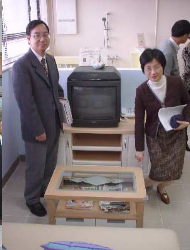
L: The Community Health Centre in Kwai Tsing - the centre for health as well as safety education.