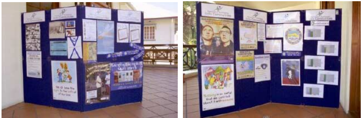
A display of some of the range of programs currently existing in Townsville and Thuringowa that fit within the WHO Safe Communities 6 criteria