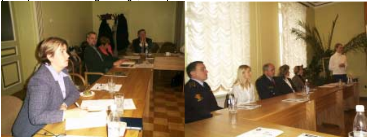
The Safe community seminar took place at Cesis District Council.

5 th -9 th November 2002: As a result of these contacts the Steering board of Spydeberg Safe Community was on a visit to Latvia in the 5 th -9 th November 2002 and participated in meetings in Riga, Straupe and Cesis.