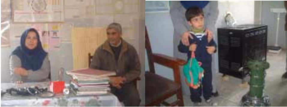
Local Health Workers presenting Safety Education. Especially the very common gas heaters at peoples homes causes burn injuries:

A study visit was made to Shiraz area where primarily Health Workers at the Health Station level described their work with safety Education in the local community: