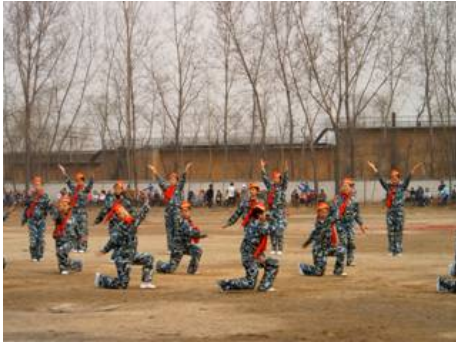
The Primary School Games in Spring