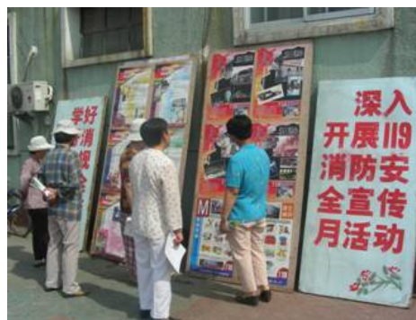
The propaganda activity on fire safety knowledge.