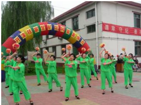
The dancing team of the old people is showing.

as ping-pong team, stick ball team, dancing team, traditional opera team and Taiji boxing team, and giving performances now and then. All of these raise the old people's life quality.