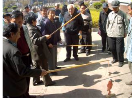
The Old People Games in Spring