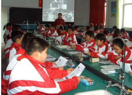
The theme meeting on “Safety” exercise of the primary school students was holding.