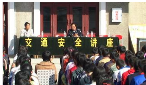
Lectures on traffic safety rules