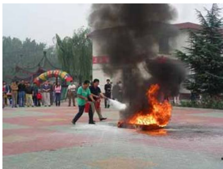
Holding the combat exercise with live ammunition on fire-fighting.