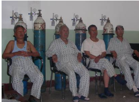
The pneumoconiosis patients are getting the recovered treatment .