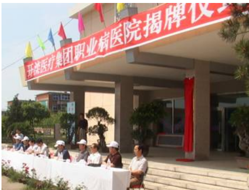
The Unveiling Ceremony of Kailuan Medical Group Occupational Diseases Hospital

The pneumoconiosis is the most occupational disease in coal enterprise . Now , there are more than 1900 pneumoconiosis patients in Kailuan Group Corporation and 96 pneumoconiosis patients in Kailuan Qianjiaying Community . In order to treat and prevent effectively the pneumoconiosis , Kailuan Medical Group set up a occupational diseases hospital in Kailuan Qianjiaying Community in Sep., 2004 for developing medicine study and surmounting the difficult case of treating the pneumoconiosis . Up to now , 840 pneumoconiosis patients have got recuperation , health check and recovered treatment by 14stages .