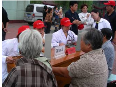
The medical volunteers are making benefit diagnosis for the old people.