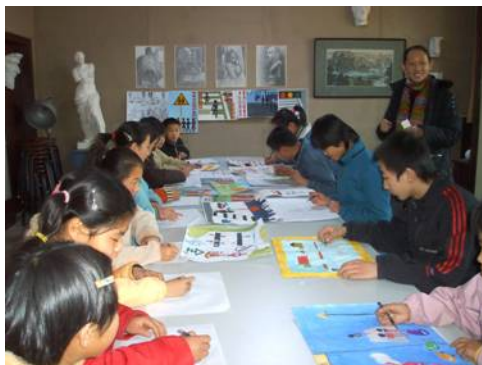
Competitive drawing by primary pupils on traffic safety

The safe education group holds the activity of “Traffic Safety Week ” in the schools each school term by taking the improvement of traffic safety awareness and the reduction of traffic injuries as the theme . The traffic safety awareness of the students has improved through the activities of the knowledge lectures on traffic safety given by the traffic policemen , the tournaments of soliciting articles on traffic safety , the shows of caricature on traffic safety , the theme meeting on the traffic safety of the students and the knowledge contest on traffic safety etc..