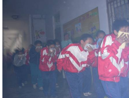
The primary school students were taking the of escaping with their lives from fire.