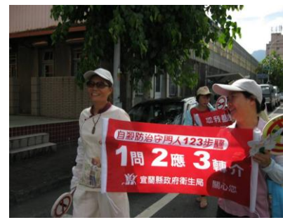
Suicide Prevention Slogan