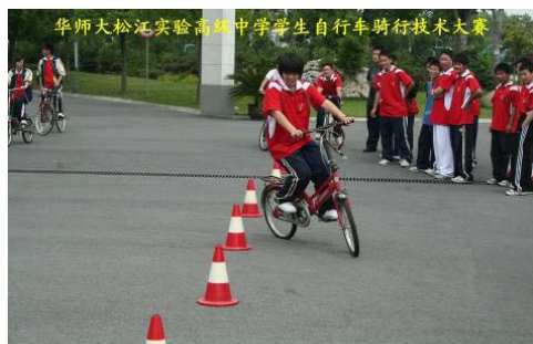
Bicycle riding test

The qualification test contains 2 parts: theory test and practice test. The practice test contains 5 parts including traffic guidance recognition, judgement test, self-protection ability, driving manners, and driving skills. Students have to pass the five rounds of test to get certificate, or take the test once again.