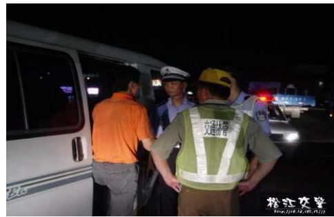
Rectification on drunk driving