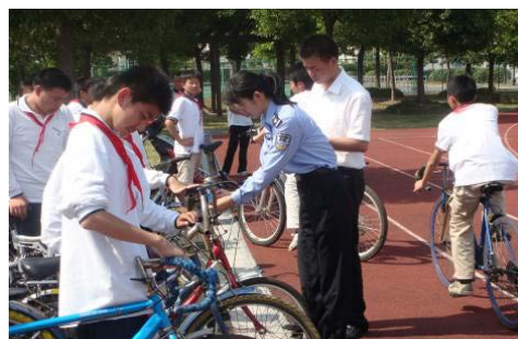
Police issue certificates