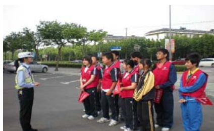
Traffic volunteer activity

◆In view of high accident rate of electric bicycle driving, people are advised not to use unsecured electric bicycles.