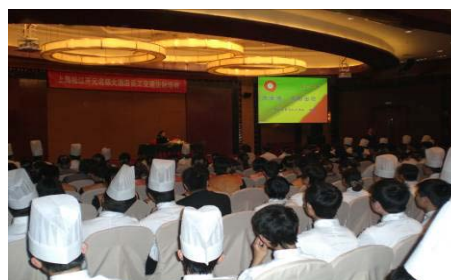
Traffic safety education for hotel staff