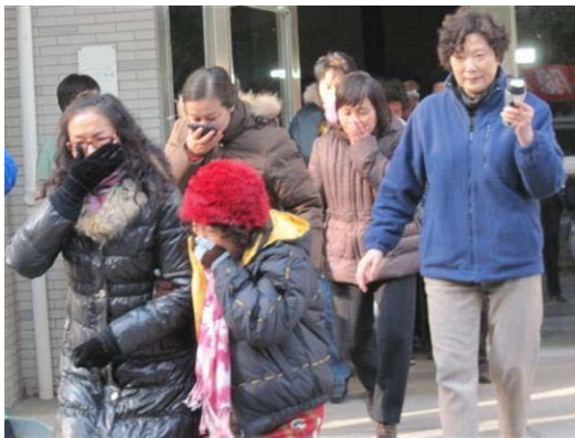
High-rise building residents' drill for fleeing for lives

We invite fire control officers and men to enter enterprises for explaining fire control knowledge to their employees, and for organizing them to drill for fleeing for their lives, for saving themselves and for putting out a fire, etc.