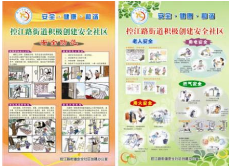
Wall Pictures on Safety Knowledge