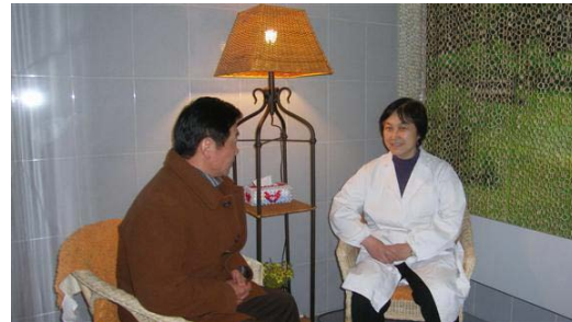
A psychological guidance room