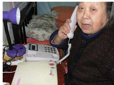
Installing Ankangtong calling device free of charge