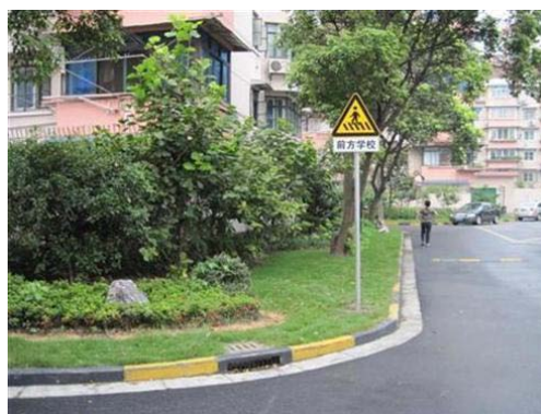
Installing Warning Identifications