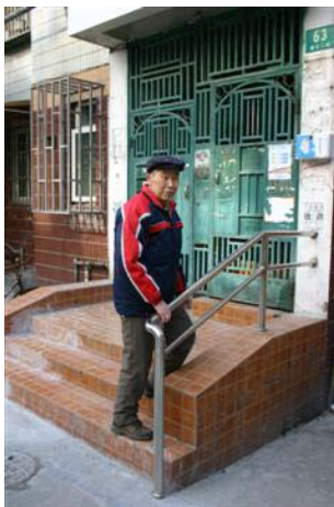
Installing stainless steel handrail at an entrance