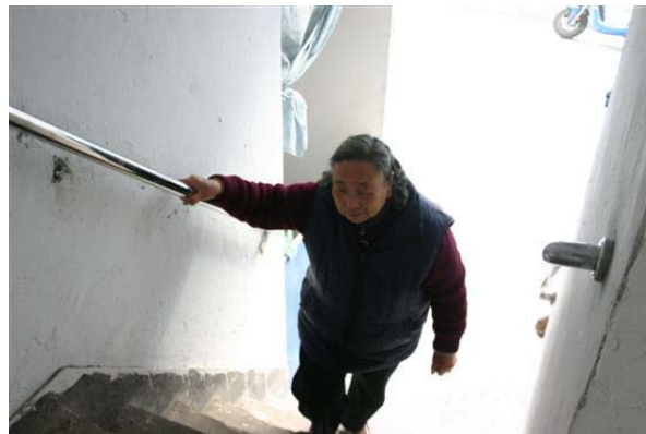
Handrail in a corridor