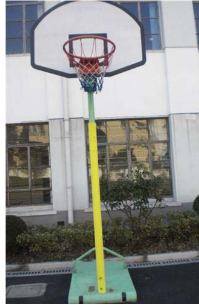
Before and after the basketball stand is wrapped up