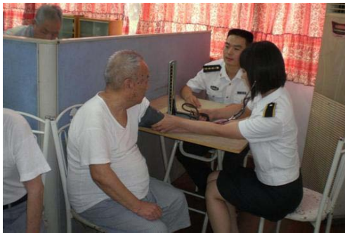
Seeing a doctor

We offered more than 1,400 senior citizens in need of help an activity of "ten helps": help have a bath, help clean, help have meals, help see a doctor, help walk, help go to toilet, help have a chat, help be happy, help be quiet and help study .