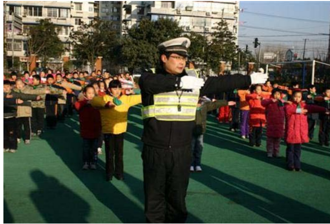
Drilling for Gesture Exercise

crossing a road, passing a crossing by bike, and serving as little drivers and little traffic policemen in a miniature traffic scene.