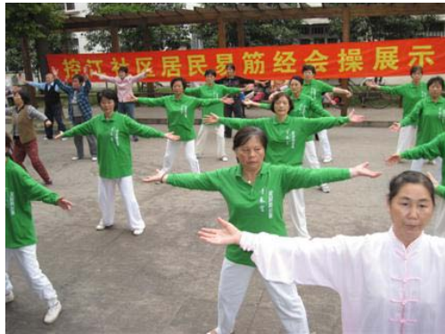
Muscle-Bone Strengthening Exercise