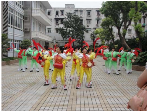
A waist drum team of senior citizen.

calligraphy and painting, craft, singing, dance, etc, have set up a traffic safety volunteers' team and a safety volunteers' team, and encourage and organize senior citizen to go out of their homes and move towards the society.