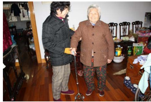
Granting four-foot walking sticks