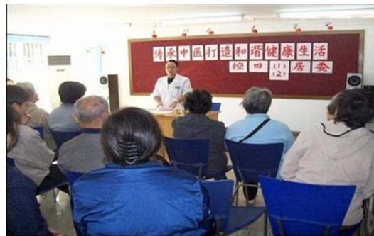
A Community Doctor's Special-Topic Coaching