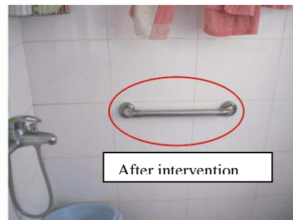
Installing handrail in a bathroom and toilet