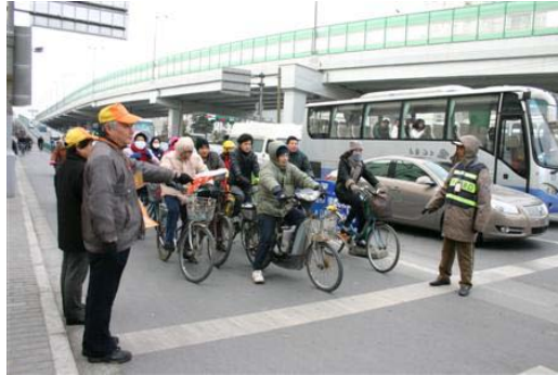
Volunteers are in action

4.8.3. Traffic Volunteers' Team. Civil servants, cadres of the neighborhood committees, community volunteers and the masses jointly participate to intervene in the unsafe behavior at the main crossings in the area.