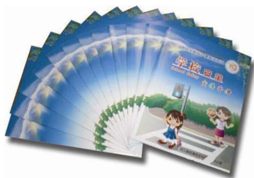
School Safety Publicity Manual

● We have made the "Three Character Primer" on safety which is easy to understand, suits teenagers and is suitable for reading, and hung copies of the primer in each grade and classroom of the middle and primary schools for students to read. We organized students to watch pictures, and exhibitions of paintings on safety knowledge, granted the "School Safety Publicity Manual" to the students, offered lectures on traffic safety, fire prevention, knowledge on fleeing for one's life, etc, organized students to look for hidden dangers in the campus and community and showed the dangers in the form of cartoons, and made common signs for traffic safety into display boards for showing and explaining in the campus.