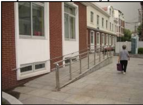
An Integrated Service Ramp in the Community

4.11.3 Construction of Barrier-Free Facilities. We installed stainless steel handrails free of charge in the toilets of the community's limb-disabled persons, installed barrier-free facilities free of charge for limb-disabled or eyesight-disabled persons, granted auxiliary devices to disabled persons of various kinds, and made 102 heavily-disabled adoptees enjoy at-home care.