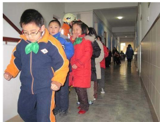
Students' drill for fleeing for lives