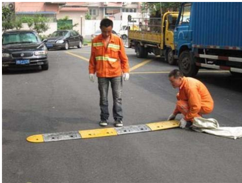
Installing Deceleration Strips