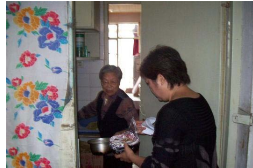
Helping have a meal