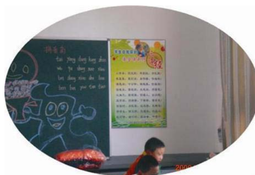
Three Character Primer on Safety