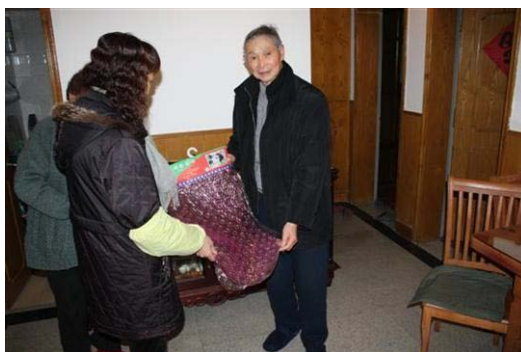
Granting non-slip mat