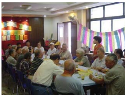
Chatting in day care home

We have set up day care homes for senior citizen neglected in the daytime, providing such services as Life Caring, medical care, health consultation, psychological counseling, etc.