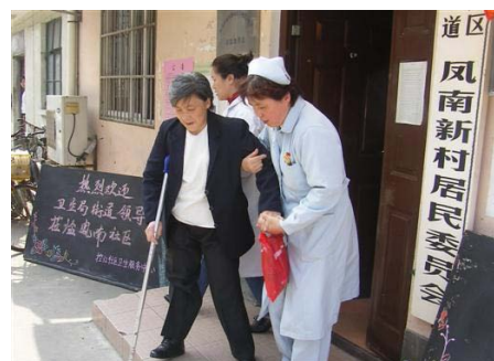
Accompanying seeing doctor