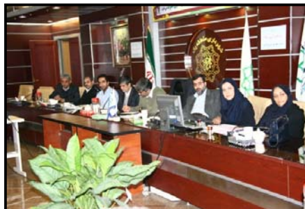
Workgroup of passages network safety