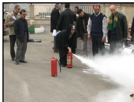
Preparing training programs about prevention from the effects of injuries and natural disasters