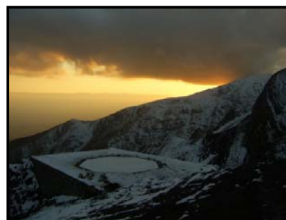
Building helicopter pad in Shirpala