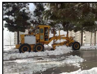
Events reduction and increasing citizens' safety level during snowing via using new methods to cleaning the snow