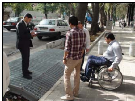
Surveying sidewalk of 'Shariati Street'