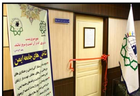
Inauguration of secretariat