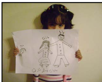
Analyzing and evaluating emotional problems of children via painting in different occasions.