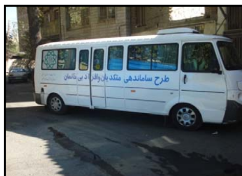
Identifying and collecting labor and street children, beggars, homelessness, sex workers, addicted persons