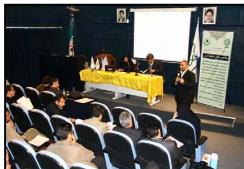
First meeting of SCSC