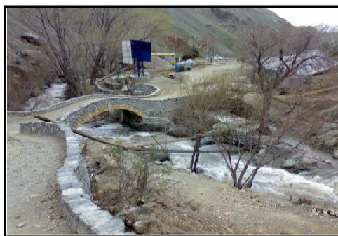
Organizing, leveling and lightening the mountaineering road of Darabad