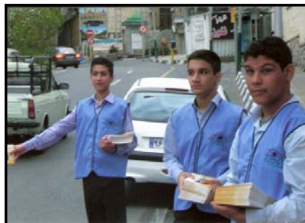
Traffic and safety training at schools and kindergartens