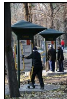
Installing standard sports sets for elderly