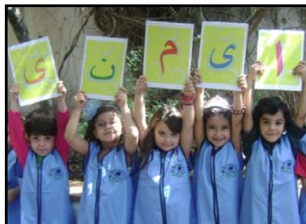
Traffic and safety training at schools and kindergartens