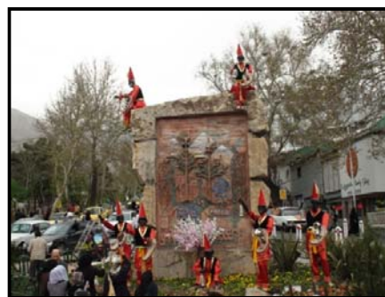
Holding happy occasion of transition to the New Year 2009 (making Haft seen statue in Tajrish sq.)