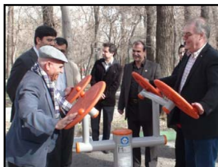
Surveying experts of WHO collaborating center of Qeytarieh Park