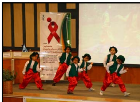
Holding the conference on 'safe community, the role of fitness and aerobic on Prevention from addiction and AIDS