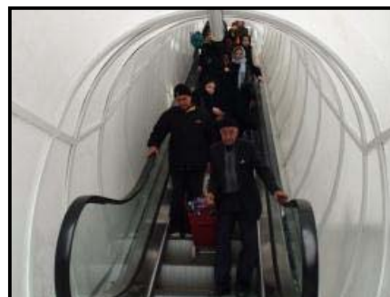
Mechanized bridge at Tajrish square