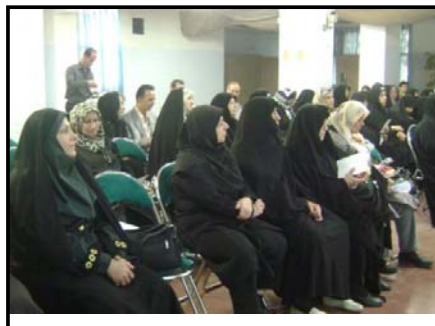
Traffic and safety training at schools and kindergartens