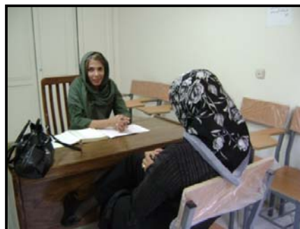
Counseling in order to reduce high risk behaviors and reduce depression and mental disorders.