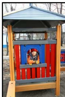
Installing wooden and standard play sets For 0-9 years old children