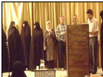
Holding opening ceremony of Kimia travelers in order to train peer elderly in safe community program