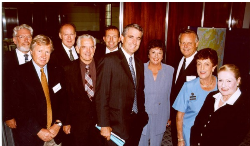
Photo from first designation ceremony in 1999