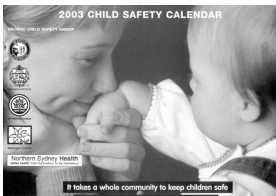
Child Safety Calendar