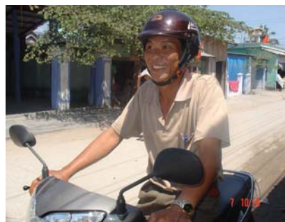
Wearing helmet for traffic safety