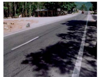
Road after interventions