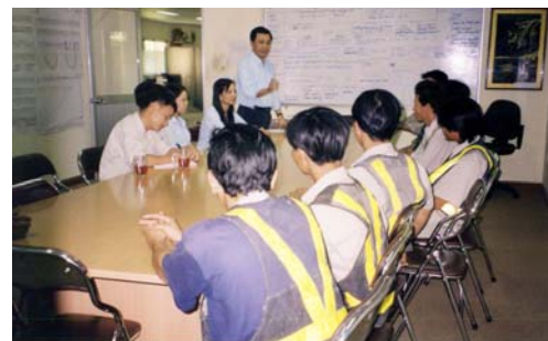
Sharing experience on HIV/AIDS Control among health staff and workers