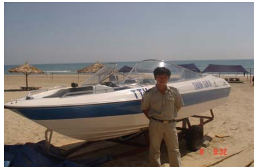
Resort rescue team