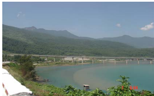
Lang Co beach