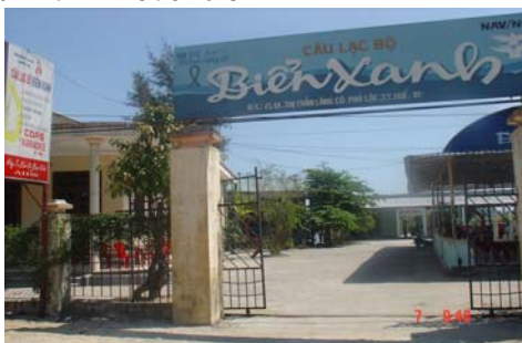
Ocean Blue Club