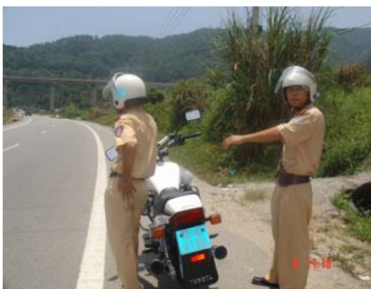
Northern Hai Van Pass check-point police on duty