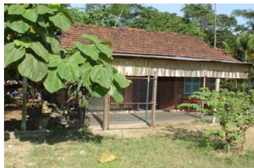
Fence around house