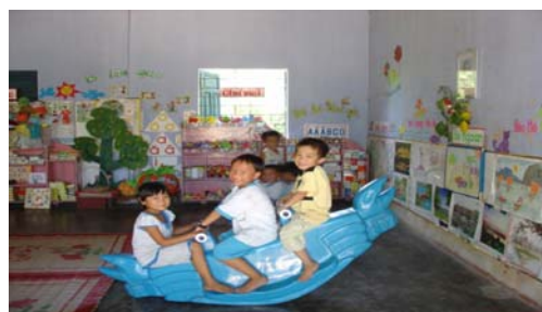
Safe play corner at kindergarten