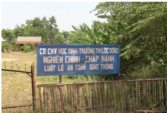
Warning sign at Loc Son 1 Primary school