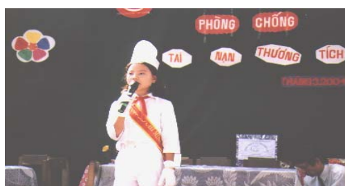
Contest of accident and injurie prevention in children at Primary schools