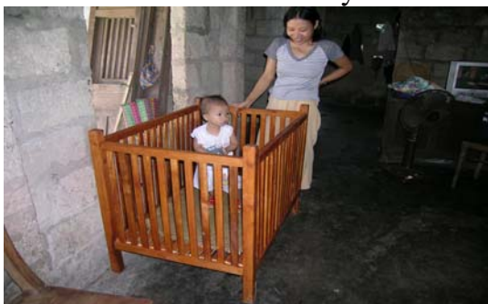
Babypen for children