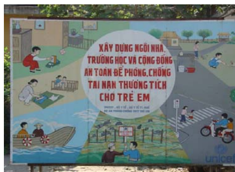
Panel in the community