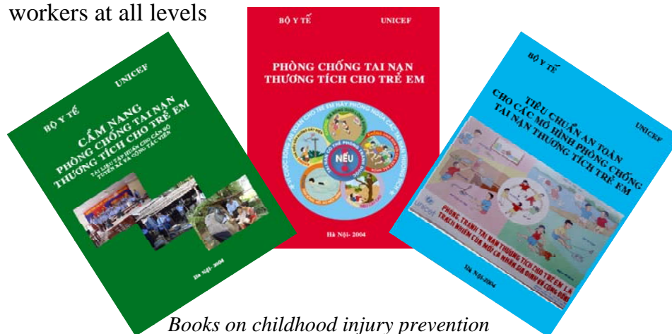
Books on childhood injury prevention