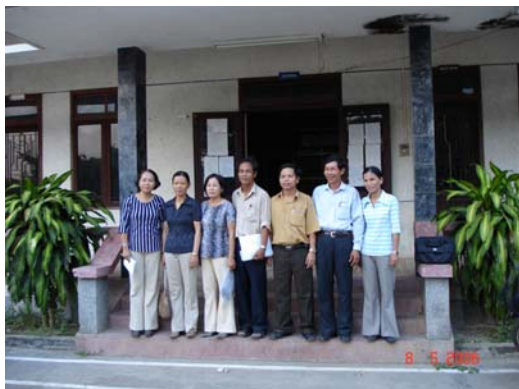
Communal Steering Committee of Injury Prevention/Safe Community Development

General public health/health promotion group: N/A