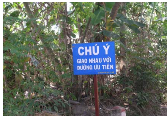
Warning sign in the conjunction of interhamletal way and 41B highway